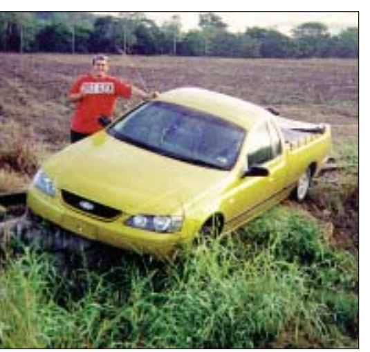
el with a "smile for life", lucky to be alive.