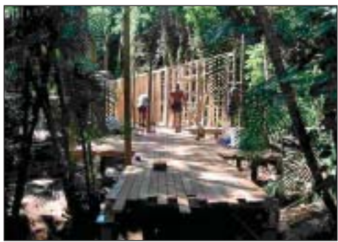
Dunk Island spa walkway.