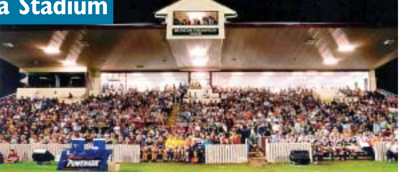
Opening night at Stadium Toowoomba drew a large crowd.

request of the client, was compressed to allow the once a year pre-season rugby league match, featuring the Brisbane Broncos, to take place.