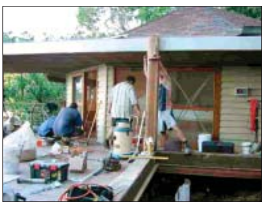
Bedarra resort villa upgrade.

Lizard Island – New gymnasium, upgrading of premium villa and alterations