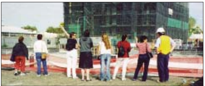
The girls inspect Hutchies' Nest Apartments Zetland site in Sydney with project leader, Julian French.

The workers were on their morning smoko break and the ladies were having breakfast after a strenuous weekend of shop-